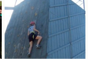
The Beaumont Climbing tower and Mud Cave will be open. New this year will be prussic climbing.