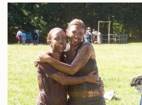
We're not sure if the obstacle course or Mud Cave got them. You'll have to try em both.