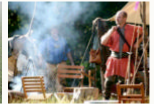
The rendezvous encampment is a great area. Come toss a hawk and drink some root beer.