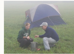
Come join nearly 700 Venturers as we camp out at the largest annual Venturing event.

This may be the end of the party, but we plan to go out with a bang. After Dinner we'll have religious services for you. Following that will be an awards celebration, officer swearing in and slideshow of the weekend. Its a great party held in the amphitheater. The party will then spill over to the Dance, complete with an adult lounge. We'll celebrate Venturing's 10th with a gigantic birthday cake. Or if you are more of an outdoors person, jump on the hay rides (nominal fee).