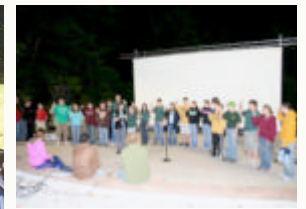
We end our weekend with an awards ceremony and slide show.