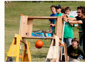
A highlight last year was 'pumpkin chunkin'. Watch out for this year's design competition.